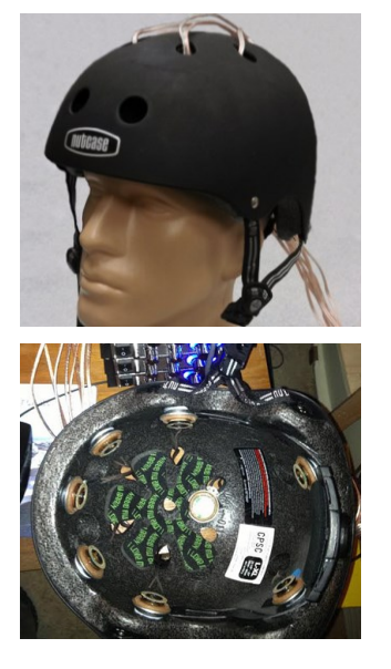
Figure 2. The outside and inside of the current headmounted tactile device prototype [7].

that the design of a head-mounted device had to reconcile with social concerns, such as not being so noisy or visually conspicuous as to draw unwanted attention. In this regard, the inclusion of the experience and perspectives of numerous participants supported a broad and thoughtful consideration of the prototype design and the goal of collecting ideas for conveying, via the sense of touch, that which would otherwise be difficult to convey. The groups also agreed that a headmounted system, when presenting spatial alerts, should account for the lateral and forward extension and flexion and longitudinal rotation of the head about the neck, relative to the vector of the approaching threat. The groups also differed on several conclusions. The second group prioritized the need to allow customization of tactile cues on any device, while the third group (citing their own experience with mobile technology) prioritized the need for optimal "out of the box" performance.