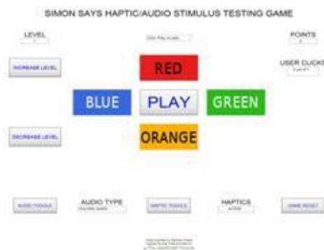
Fig. 1. Accessible multimodal memory game

‘Simon™’ [7] is an electronic game, where the user is presented with a sequence of flashing colored lights and tones from an electronic device. The user is required to replicate the sequence, by pressing the colored buttons on the device in exactly the same order as originally presented. A multimodal game has been developed based on Simon™ (Figure 1). This was designed with the aim of being accessible to users who are blind. The user is presented with the following forms of feedback: speech, non-speech audio, haptics, and graphics. The user can use one or more forms of each type of feedback to play the game.