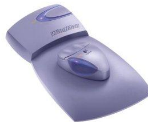
Fig. 2. Logitech Wingman force-feedback mouse [14]

Blind users have the choice of using the keyboard, or using both the keyboard and the Logitech Wingman force-feedback mouse (Figure 2) to interact with the game. The interface contains four different-colored buttons (labeled ‘red,’ ‘blue,’ ‘green’ or ‘orange’) arranged in the shape of a cross. Each button is mapped to an earcon or speech icon, which is presented for a period of 100ms at 60dB using recommendations from [5] (Table 1). The buttons were recreated in the auditory domain using non-speech sound by manipulating the pitch and spatial position of a pure sine tone. Upward movements are indicated by a 1 second sine tone with an upward frequency glissando (220Hz-880Hz) and a sine tone with a downward glissando indicates a downward movement (880Hz-220Hz). Left and right positions were implemented by adjusting the spatial position of a 1 second sine tone (440Hz) earcon accordingly. Haptic spring effects were developed and integrated with the interface to provide guidance towards a target (button labeled ‘red,’ ‘blue,’ ‘green’ or ‘orange’). For example, to prompt the user to move rightwards, the mouse gently guides the users’ hand towards the right-hand side of the page.