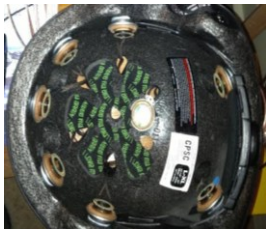
Figure 1: Tactile Headset

The head-mounted tactile interface prototype is similar in design to the system developed by Kalb et al. [6]. The interface consists of a set of tactile actuators, controlled by an audio adaptor (Vantec USB External 7.1 Channel Adaptor) and a laptop. In the current version of the prototype, up to eight actuators are affixed to a helmet (Figure 1).