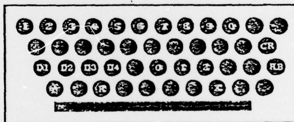
Figure 2. A diagrammatic representation of the keyboard manipandum.