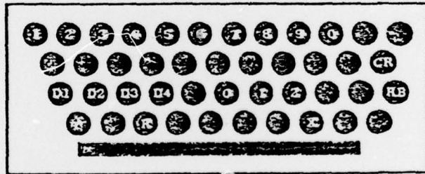
Figure 2. A diagrammatic representation of the keyboard manipulandum.