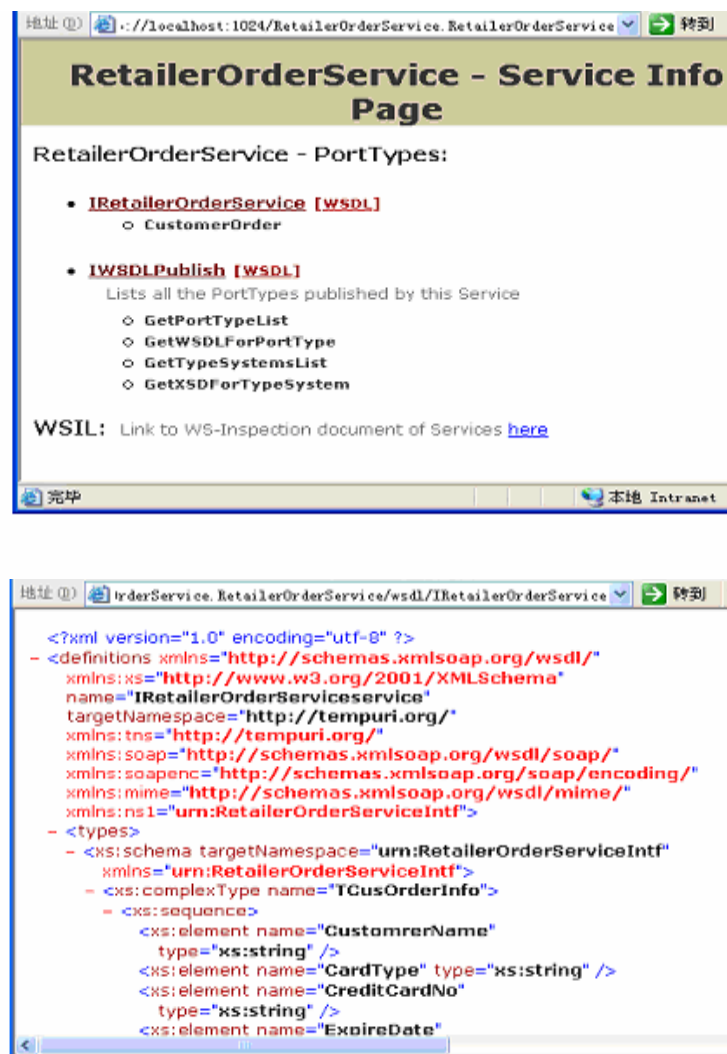
Figure 4. A Web Service Information Page and Content of the WSDL File

transformed into the SOAP format. The credit checking Web service, for example, gets information about the retailer from the wholesaler's service request and returns the result, both in the form of SOAP messages. The use of dynamic binding and business decision module enables the wholesaler to find the most appropriate supplier for the transaction. The composition of several web services greatly enhances the flexibility and agility of business processes, and overcomes the interoperability problem of traditional e-Businesses. The change made to one Web service will not affect others.