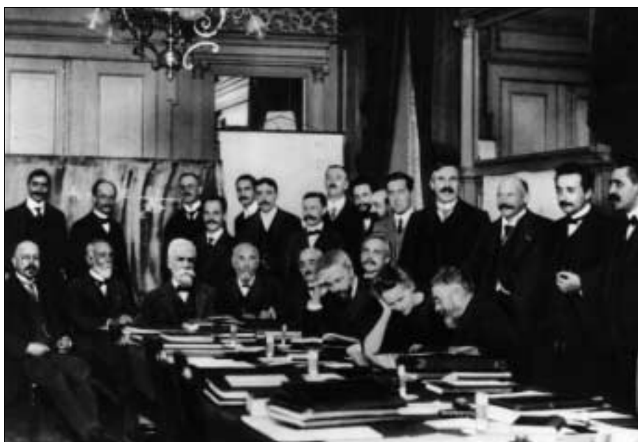
Physics in motion – Einstein's theory of Brownian motion allowed Jean Baptiste Perrin to demonstrate the existence of atoms in 1908. Perrin, who won the 1926 Nobel Prize for Physics for this work, is sitting sixth from the left, leaning forward, while Einstein is standing second from the right. This picture was taken at the first Solvay Congress in Brussels in 1911.

Brown is, of course, better known among physicists for the phenomenon of Brownian motion. In the summer of 1827