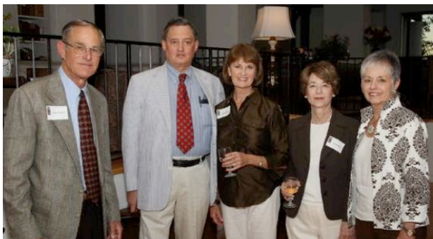
With Laguna Blanca Alums in Santa Barbara